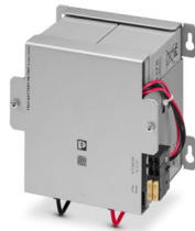
Battery module (device with battery), VRLA-AGM, 24 V DC, 7 Ah

Please be informed that the data shown in this PDF document is generated from our online catalog. Please find the complete data in the user documentation. Our general terms of use for downloads are valid.