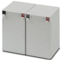
Replacement battery, VRLA-AGM, 2x12 V DC, 12 Ah

Please be informed that the data shown in this PDF document is generated from our online catalog. Please find the complete data in the user documentation. Our general terms of use for downloads are valid.