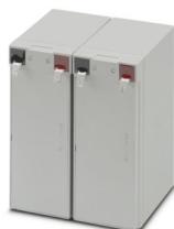
Replacement battery, VRLA-AGM, 2x12 V DC, 7 Ah

Please be informed that the data shown in this PDF document is generated from our online catalog. Please find the complete data in the user documentation. Our general terms of use for downloads are valid.