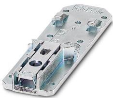
Universal DIN rail adapter

https://www.phoenixcontact.com/us/products/2320089